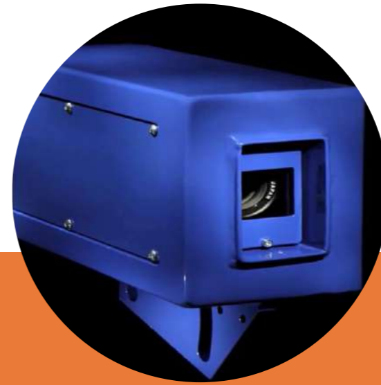
A500 Loop scanner

The system is composed of a power supply switchboard and a vision system cooled on three sides in such a way as to be positioned close to the bars