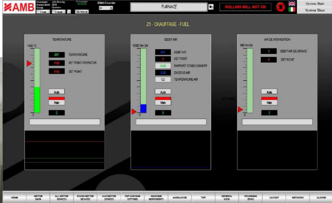
FOR RE-HEATING FURNACES